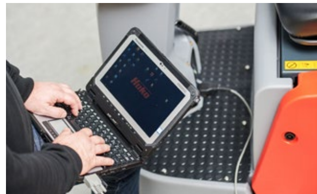
Easy access to the diagnosis interface for maintenance purposes and to modify machine settings.

We offer you attractive, customised rental and leasing options for more flexibility and cost-efficiency.