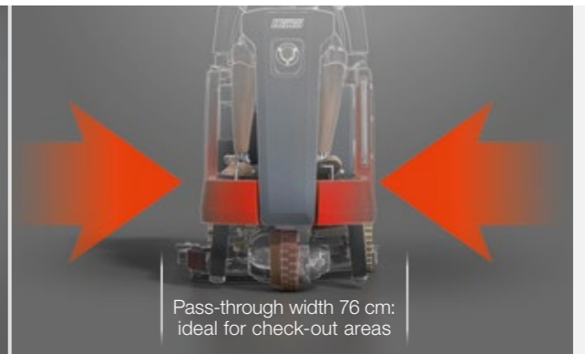
Pass-through width 76 cm: ideal for check-out areas