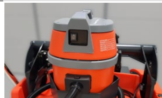
Extended application options An additional vacuum cleaner, which can be installed at the rear end of the Sweepmaster B980 RH, ensures clean floors in each and every corner.

Equipped with suitable accessories, Sweepmaster machines offer the perfect solution for almost every imaginable sweeping task. Optional extras such as an overhead guard for working in warehouses or production halls improve occupational safety and protect the operator's health. In addition, the Sweepmaster models 980 RH and 1200 RH can be upgraded with a light debris collector via Hako's quick-connect system.