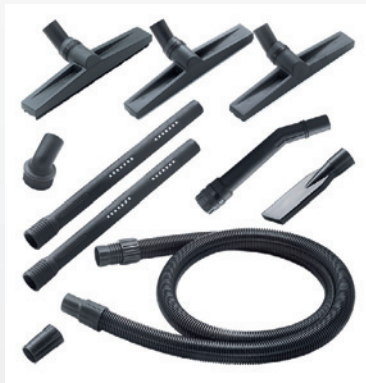
Accessory kit for Cleanserv V L3-70 I