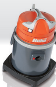
Cleanserv VL1-15 Cleanserv VL1-30