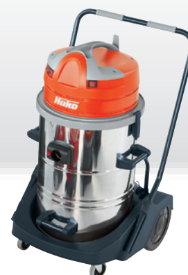
Cleanserv VL3-70 I