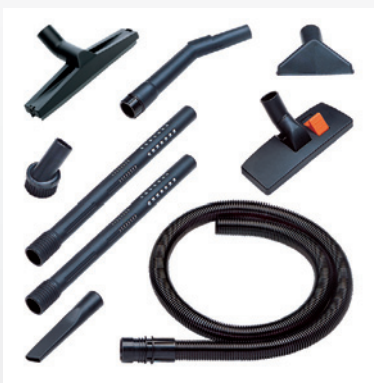
Accessory kit for VL1-15 und VL1-30

Form, colour and design are subject to change without prior notice for the benefit of further technical development. Images may show optional equipment. *Option